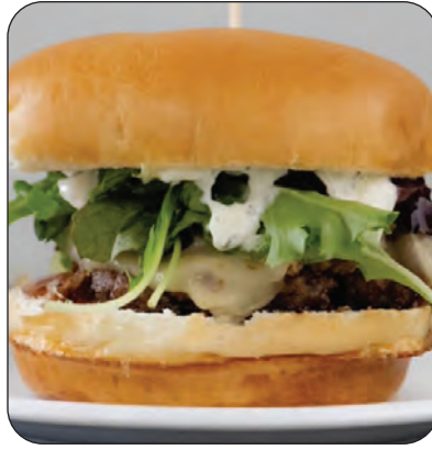
Rock'n Rootbeer Burger, Carlo's Cucina's in Sandy Hook.