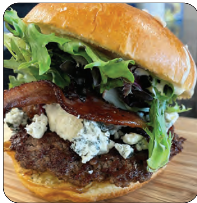
Bacon & Blue Quarry Burger, Something Beautiful Café's in Stonewall.