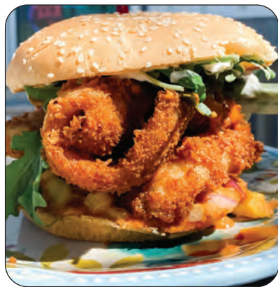
The Feisty Pickerel Burger, Kahleigh's Brew Barn's in Riverton.

Don't miss out on this two-week festival and a chance to support local restaurants in your area through delicious never-before-seen burger creations.