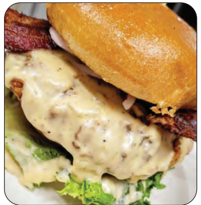
The mac, Altona Hotel's Le Burger in Altona.