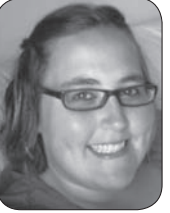
DISTRIBUTION Christy Brown