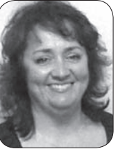
PRODUCTION Debbie Strauss