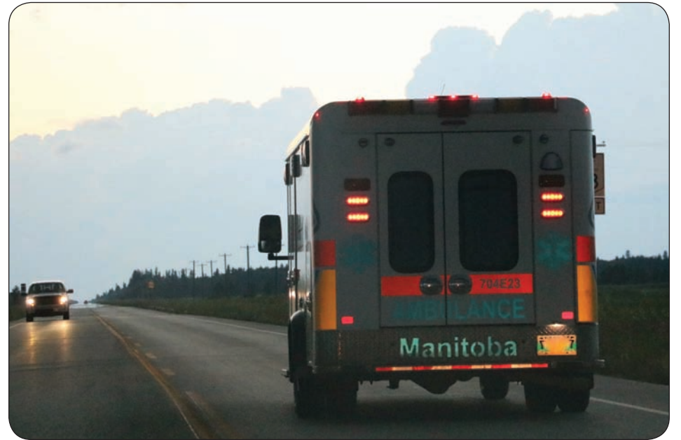
Ambulance attendants and other health professionals voted for a strike mandate. Their union, the MGEU, is negotiating with the Interlake-Eastern RHA.

Van Denakker said the Interlake-Eastern RHA (formerly two separate health regions until 2012) is underfunded in comparison to other RHAs. The provincial average is about $6,000 per head, but the Interlake-Eastern RHA is "somewhere around $2,000