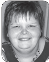
PRODUCTION Nicole Kapusta