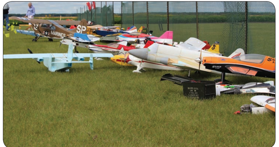
Ten model planes line the fences at Gimli Model Fest, taking place at the Interlake Radio Control Model Club site on Minerva Road west of the Town of Gimli.

The plane is a model of one that Saunders Aircraft Company built in Gimli in the 1970s. The government cut funding for production, so the company only made one, Ansell ex-