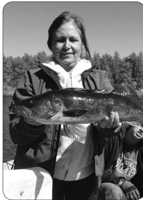
Matheson Island is a prime fishing spot.

“It's putting a Band-Aid on something. As soon as you get a little bit of truck traffic, the Band-Aid busts ...,”