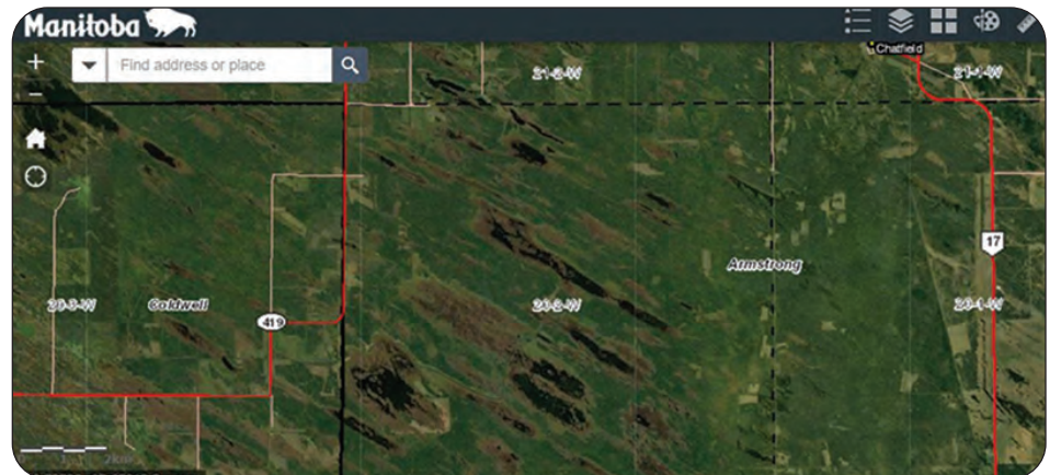
The Narcisse Wildlife Management Area in the RM of Armstrong.