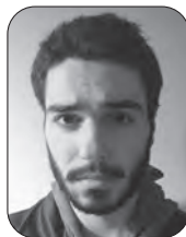
REPORTER/PHOTOGRAPHER Ty Dilello