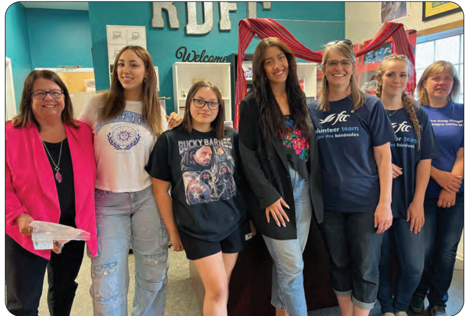
EXPRESS PHOTOS SUBMITTED

The Arborg Farm Credit Canada (FCC) office hosted a fundraiser barbecue in support of Drive Away Hunger on June 23 and raised $5,936.50 plus 137.7 pounds of food to the Riverton & District Friendship Centre's food bank.