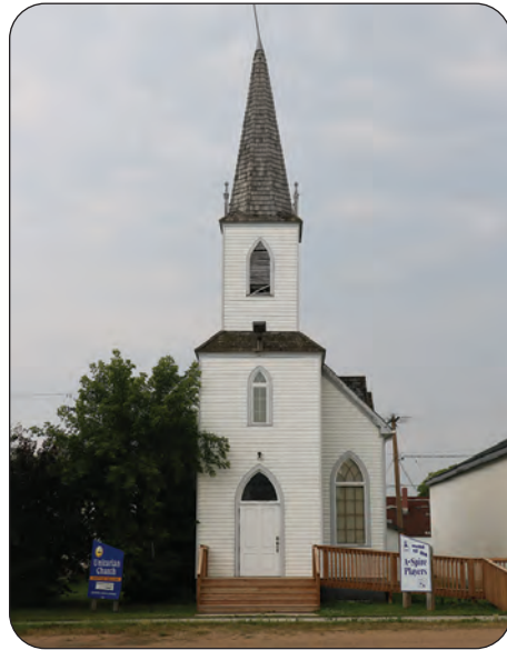
The A-Spire Theatre in the Unitarian Church.

With the mantra "The show must go on" foremost in their minds, the four