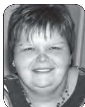
PRODUCTION Nicole Kapusta