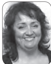
PRODUCTION Debbie Strauss