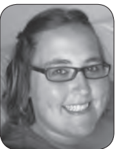
DISTRIBUTION Christy Brown